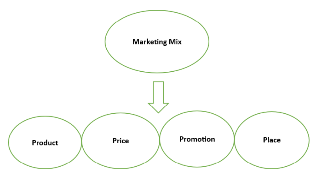
Figure 1. Marketing Mix

In modern marketing, the criterion mostly used is "marketing mix". This concept is thought to have first emerged in Borden's "The Concept of The Marketing Mix", and the person who conceptualised this model was McCarthy (Berry, 1990). In the 1960s, McCarthy stated that modern marketing should be built on the 4Ps (product, price, promotion and distribution) (Motley, 2002).