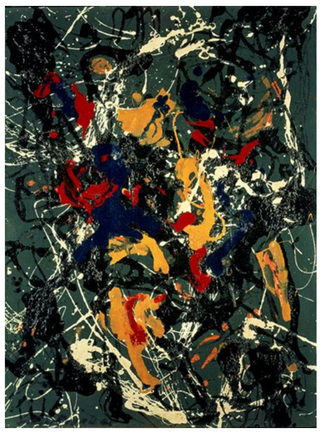
Figure 4. Jackson Pollock, Number 3, 1948

In this work of Jackson Pollock in 1948 called "Number 3" (Figure 4), yellow and red colors are immediately noticeable. Pollock, who performs abstract and imaginary works at the same time, differs from other artists with definite lines. Pollock, who offers an important understanding of art, makes a miraculous debut in art and engages in important activities to reduce the intensity of his desires. Their thoughts that have lost their warmth are replaced by a new one. Pollock, who brought an important breath to art, creates the most important formations of Abstract Expressionism.