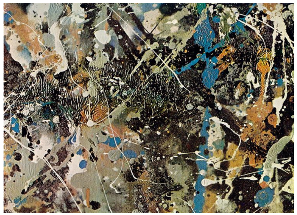
Figure 5. Jackson Pollock, Number 1 (Lavender Mist) (detail), 1950

Artist Jackson Pollock's rejection of traditional easel painting is internationally recognized as a turning point in postwar art. Pollock's paintings did not appear as randomly as one might think. The artist aimed to express his emotions in his works rather than drawing them. This allows the artist to control the flow of the paint; None of them emerged by chance, without a start and end date, they emerged as a whole with unlimited formal freedom. Therefore, this expresses the freedom that the artist expresses while creating a different formation in the artist. Therefore, this integration of art with the artist brought about many new expansions and influenced many movements such as the Abstract Expressionist artists that came after it (Ahmetoğlu and Denli, 2013).