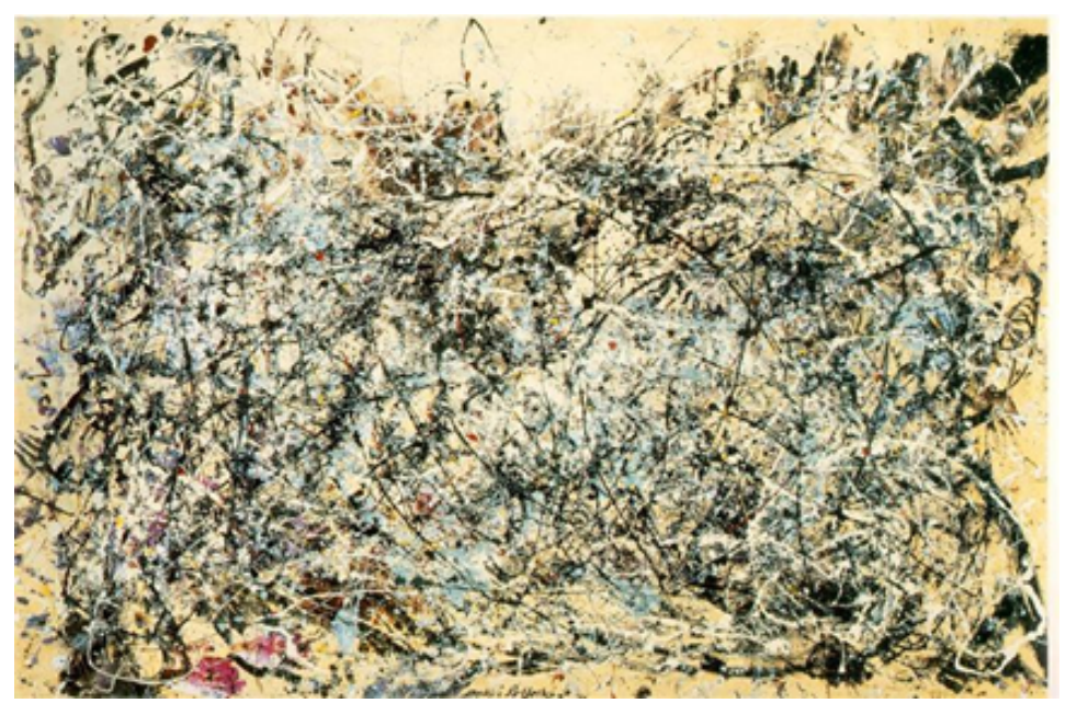
Figure 2. Jackson Pollock, No.1, 1948

The free spirit played an important role in making Jackson Pollock the most famous modern man. It was the artist's hometown and, in many ways, the most influential person of his generation in America. Artists are featured in the press in a more meaningful way and often make an impact on ordinary people. After his incredibly contemporary expression of artistic freedom and his untimely death in a car accident that lasted for generations, he is being hailed as a revered icon of a sense of freedom and joy, a new hope for young artists. Besides a number of contemporary painters and sculptors, a heterogeneous group was associated with Pollock, an informal movement sometimes also called Abstract Expressionism. He was responsible for instilling vitality and faith in American art. Compared to the period immediately after the Armory Show, the artist is in his best form. His work is seen as an unexpected intersection of an aimless, dogmatic stereotype. in the 1930s, while creating new forces and energies in the artistic methods that dominated and consolidated advanced American painting, the painting of the independent artist Pollock was animated by his own determination