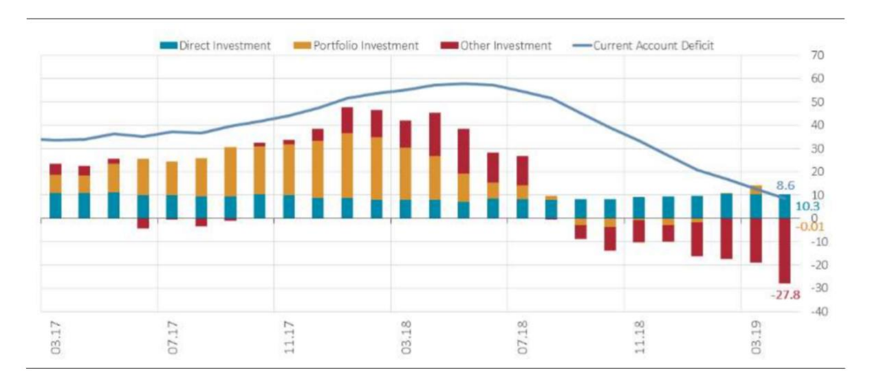
Figure 2: FDI and Investment flows

their FX holdings by twenty percent (Aug'18 – Apr'19), the net FX position of private firms remains high, and foreign borrowing is essential to cover debt obligations (Taskinsoy 2019a). Simultaneously, FDI alone falls by 40 points in 2017, confirming the mounting need to recover FX resources (Figure 2):